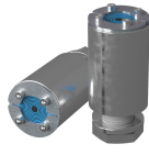
SLA RS 50 AISI316