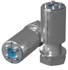
SLA RS 25 AISI316