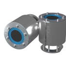
SLA RS 100 GALV