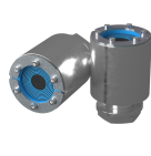
SLA RS 75 AISI316